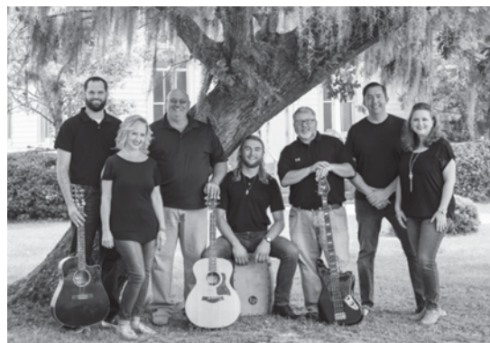
The Goshen Travelers

Note: Commuters are welcome to attend and may pay the $25 fee at registration. Please pay for any meals at the front desk before entering the serving line.